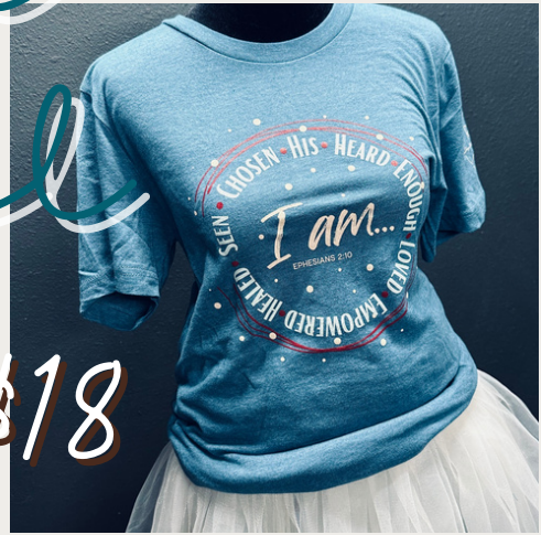
Short Sleeved T-Shirt

Special Note: Sizes run small so please consider this when ordering.