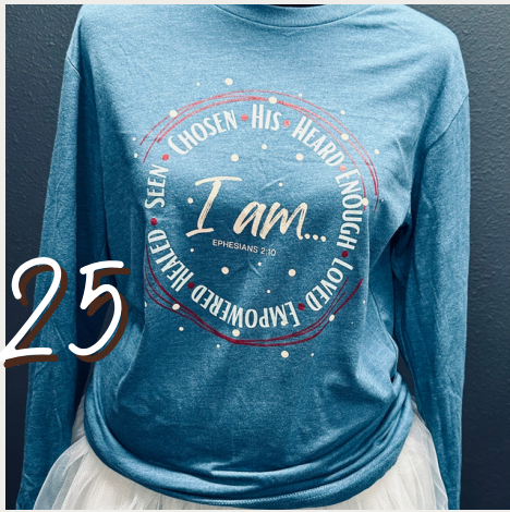
Long Sleeved T-shirt