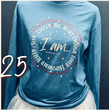
Long Sleeved T-shirt