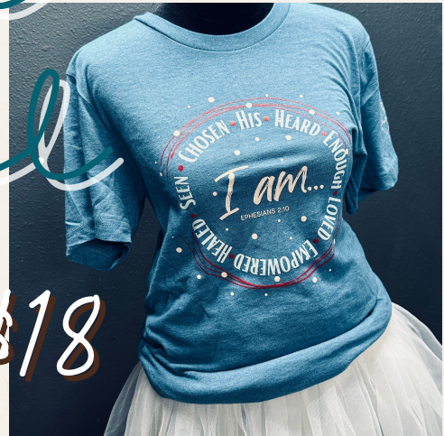
Short Sleeved T-Shirt

Sizes run small so please consider this when ordering.