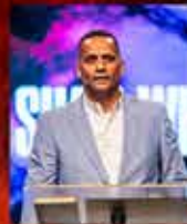
CHOCO DE JESUS