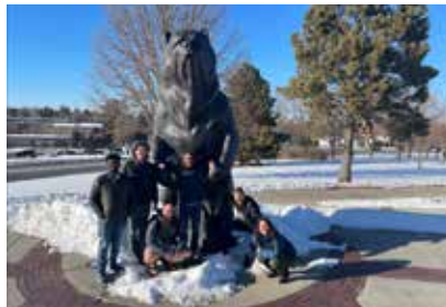
Our missions team from Colorado State U. Chi Alpha!

This semester, for our Thursday night services on campus, we will be going through the Gospel of Mark. Each week, we will be going pretty deep into the life and teachings of Jesus, as well as covering the ultimate purpose for why He came - to die for our sins and rise from the dead! We are already 3 weeks in, and our students have been growing so much. Many have never read through the Gospels before. You can watch all of our messages on our YouTube channel, so please subscribe!